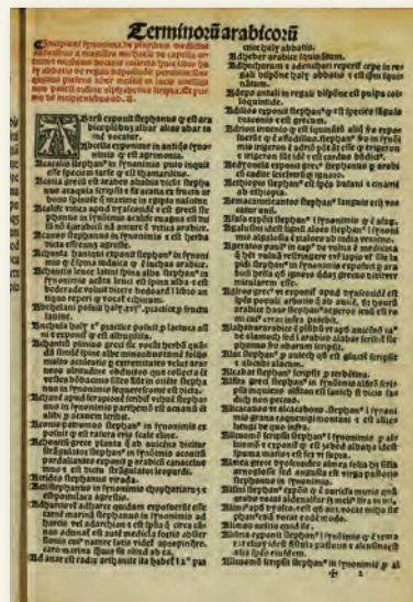
Haly Abbas's seminal tenth century medical text Liber Totius Medicine Necessariae