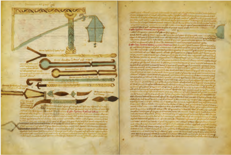
Liber de cirurgia by Albucasis – a pivotal fifteenth century medical treatise detailing early Arab surgical practices and instruments