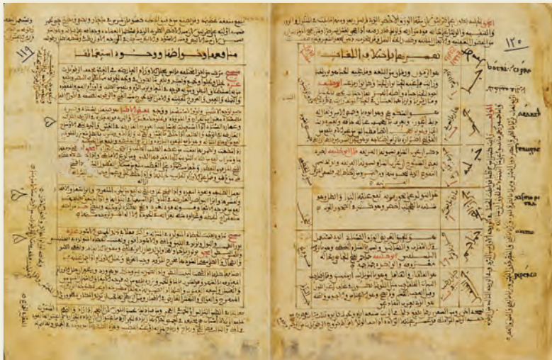
Ibn Baklarish's Kitab al-Musta'ini – Book of Simples: Medical Remedies between Three Faiths in Twelfth-Century Spain